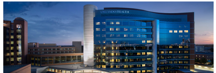
Orlando Health Heart Institute

For more than 100 years, Orlando Health has served the Central Florida community. The health system is comprised of 16 hospitals and emergency departments as well as rehabilitation services, cancer institutes, heart institutes, imaging and laboratory services, wound care centers, physician offices for adults and pediatrics, skilled nursing facilities, an in-patient behavioral health facility, home health care services in partnership with LHC Group, and urgent care