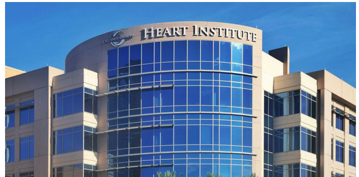
Orlando Health Heart Institute