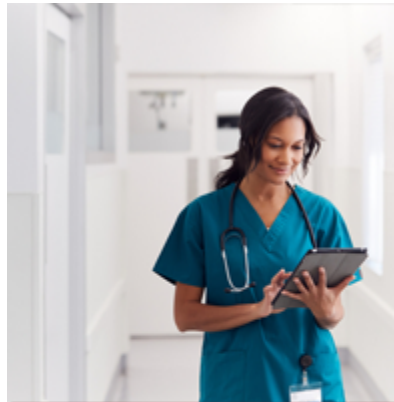
PROVIDER COMPLIANCE CONSULTING