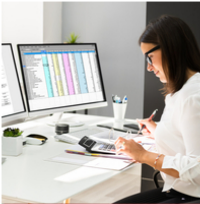
CODING AND BILLING CONSULTING